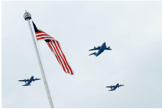
As Malaysians, we are independent, standing up with our own forces. Un-swayed.

So then, as people of this free nation, let us continue to express love, respect, and appreciation for one another, not forgetting our identities as citizens of His nation, but embracing the underlying importance.