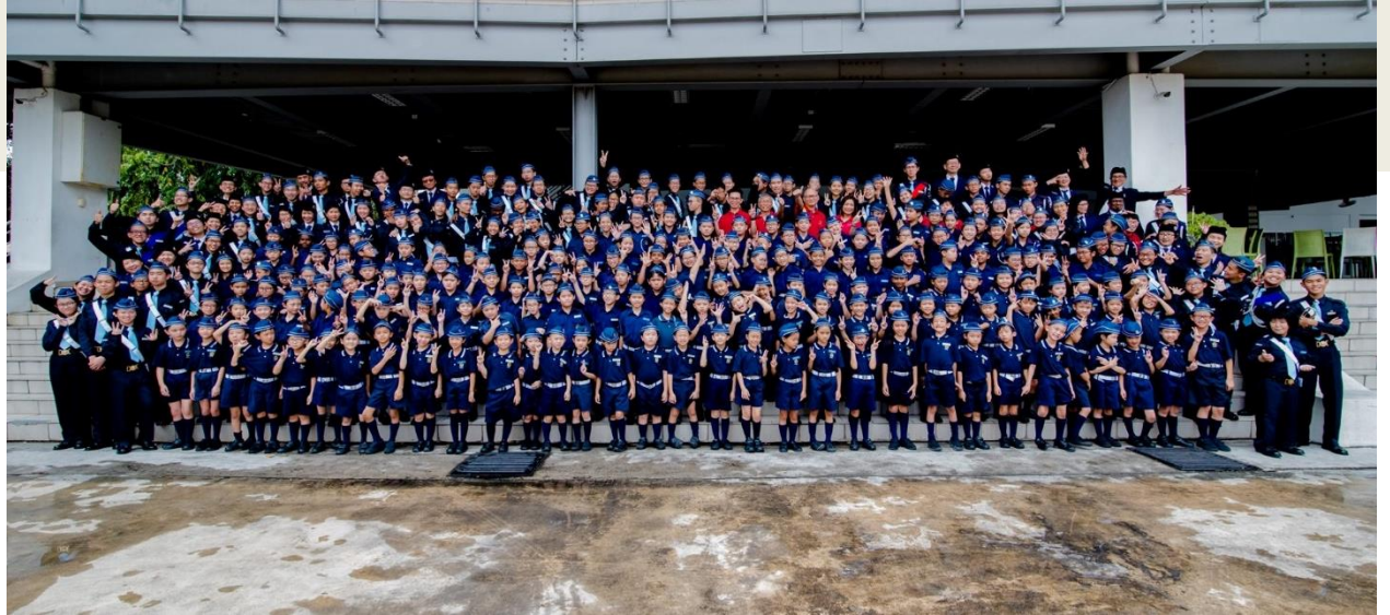
Back in July 2019, E&A